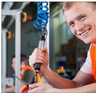
Creating a positive and open environment