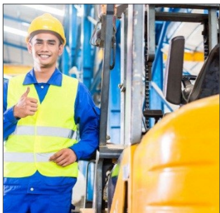
Helping your team members understand the concepts in our Code of Conduct