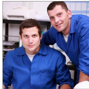
Preventing retaliation against those who speak up