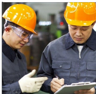
Holding team members accountable for their behavior