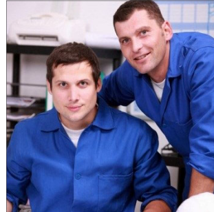
Preventing retaliation against those who speak up