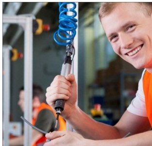
Creating a positive and open environment