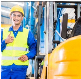
Helping your team members understand the concepts in our Code of Conduct